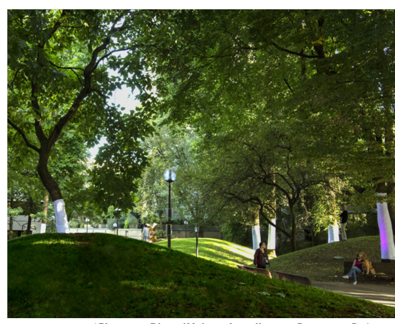
'Changing Places' Halprin Installations Pettygrove Park