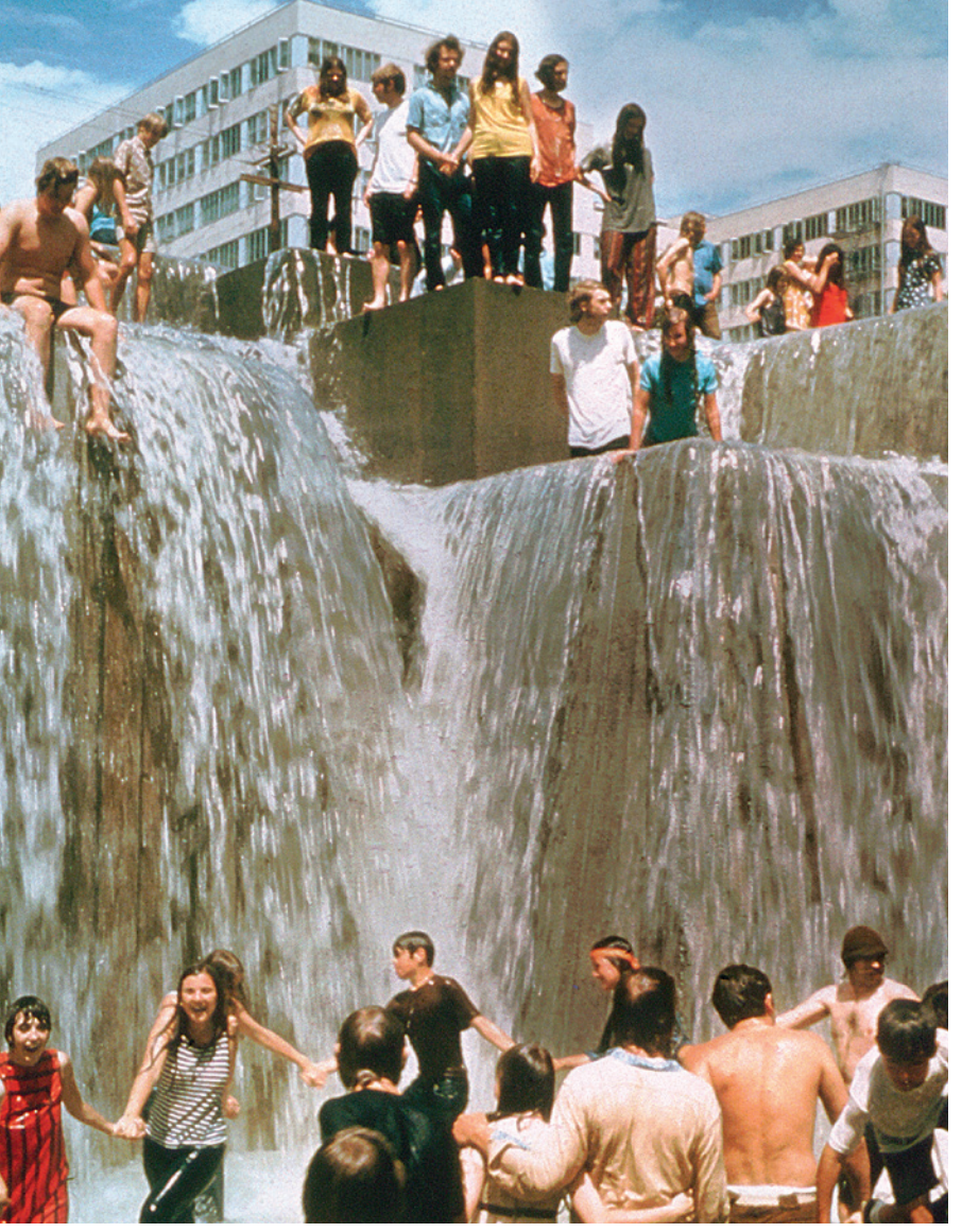
June 1970 Opening Fourcourt (Ira Keller) Fountain