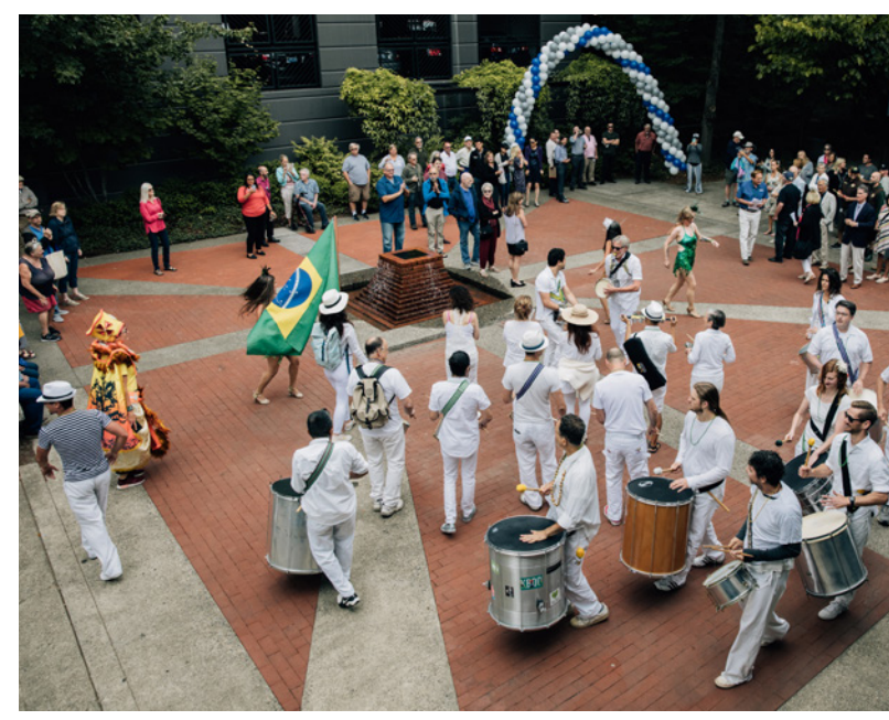
The Big Splash Celebration Source Fountain